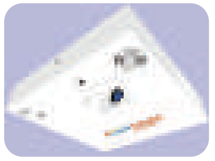
Fixed ceiling system projecting onto a floor or table.